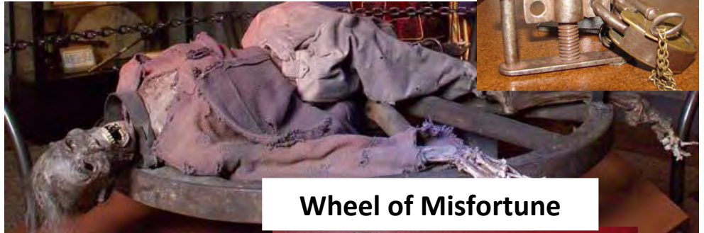
Wheel of Misfortune

Photocopy the activity sheet „Torture Diary“ for each student.