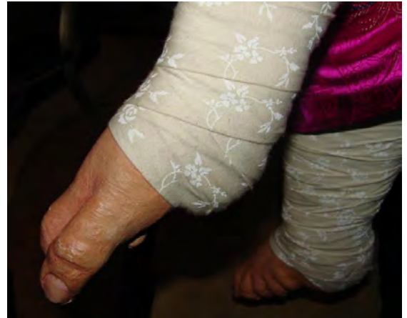
Broken & Bound Feet