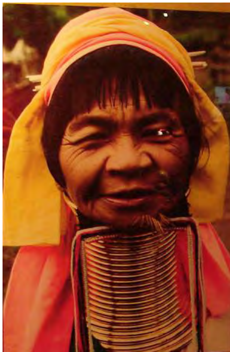
The Padaung Women of Myanmar

In a later class, students present their collages and written descriptions. You might invite other classes to your "Beauty Around the World" exhibit.