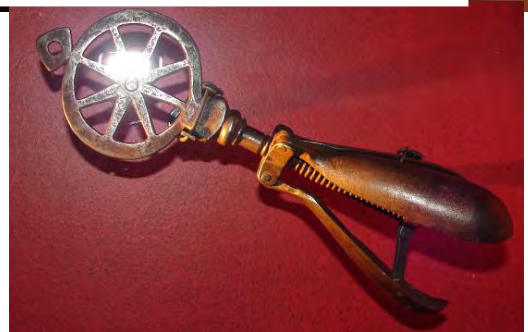
Pear of Agony

Explain to the class the torture chambers of medieval times, describing what they looked like and the conditions in which people were kept. Remind them of what they saw at their trip to Ripley's. Talk to your students about what types of punishments were inflicted and the crimes the prisoners were guilty of.