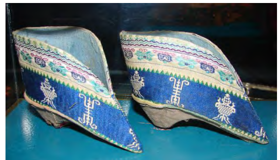
Chinse Lily Slippers