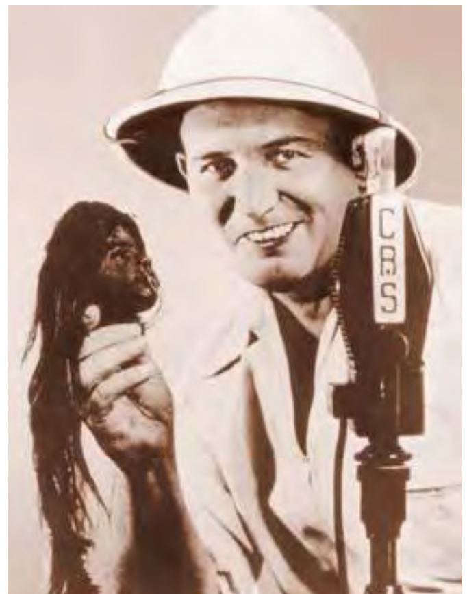
Robert Ripley with a Genuine Shrunken Head!

Once back in the classroom review what students have discovered by discussing the notes they made during the school trip. Find out which themes they found most interesting which may determine your decision on the sequence of the activities in Curious Cultures.